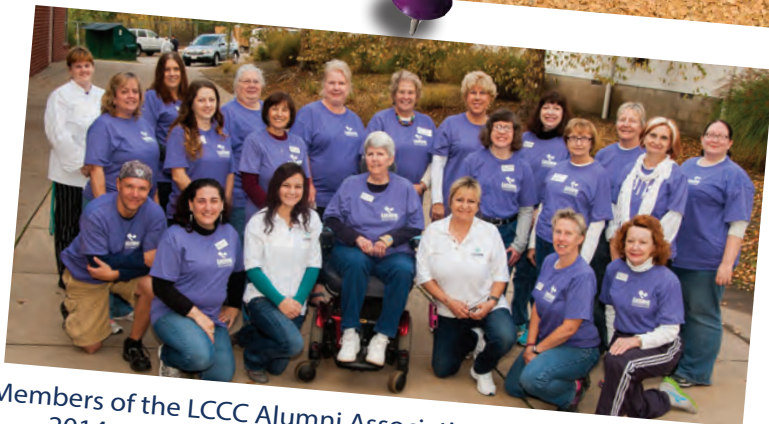
Members of the LCCC Alumni Association at LCCC's Craft Festival. 2014 marked the 25th anniversary of the craft show.